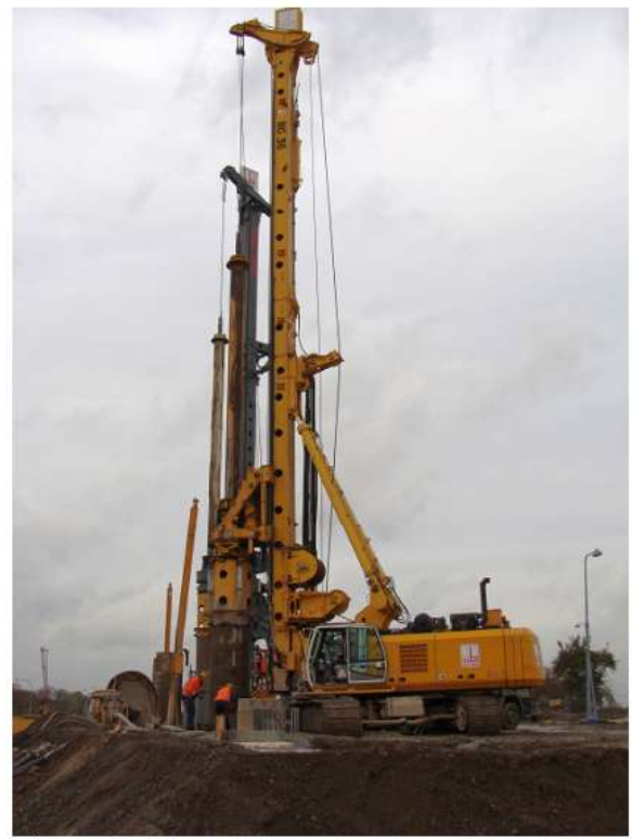
Figure 3: Secant pile wall under construction at a river lock in northern Germany.