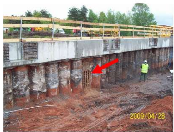
Figure 2: Secant pile wall with flaw at a power plant construction site in France.